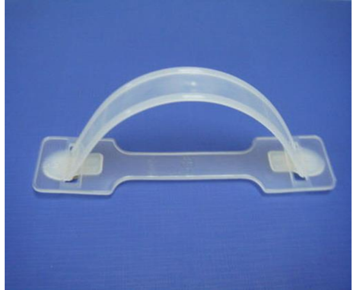
Top Plastic Handle for boxes