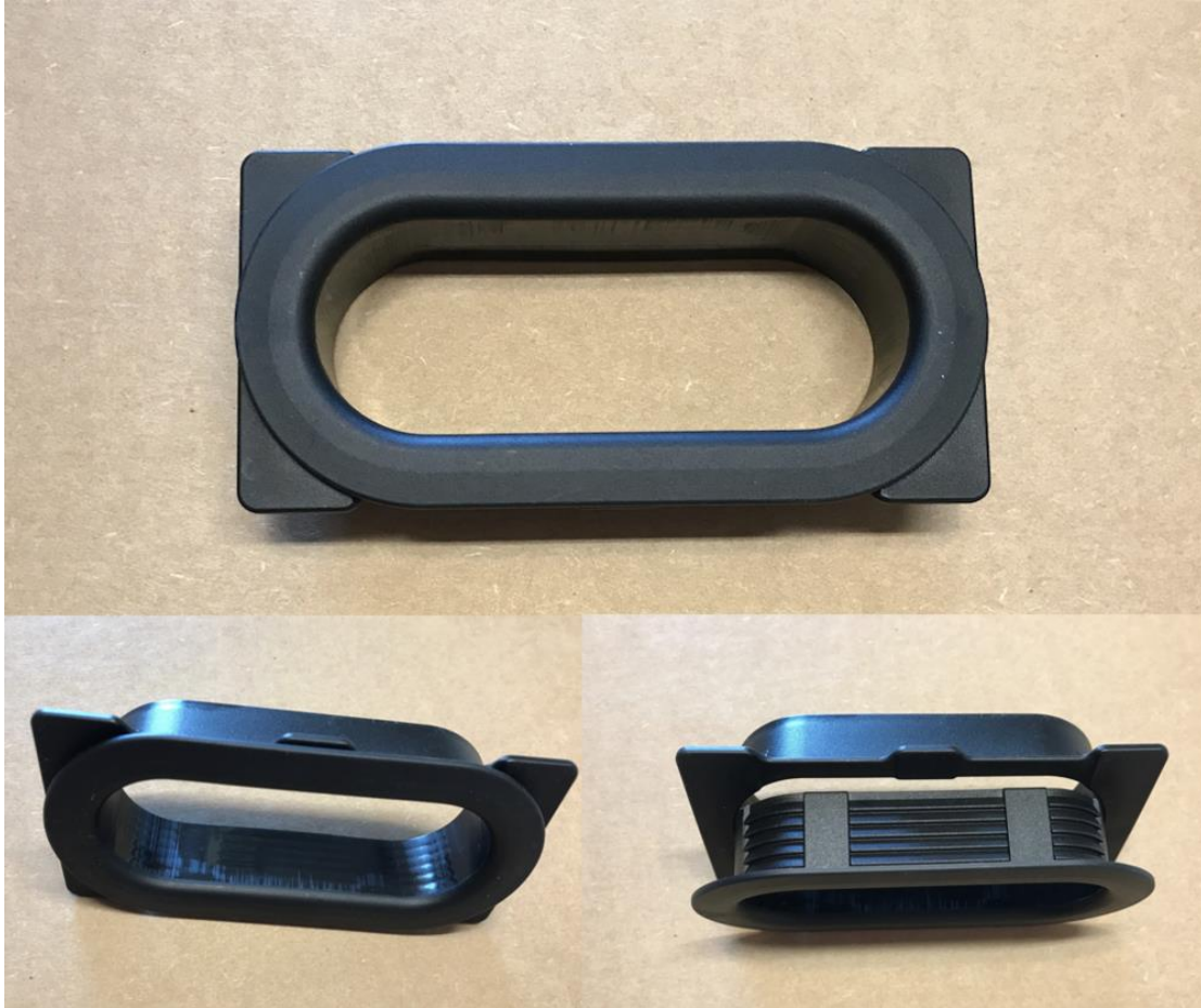
Hand Hold Hole Reinforcers for boxes